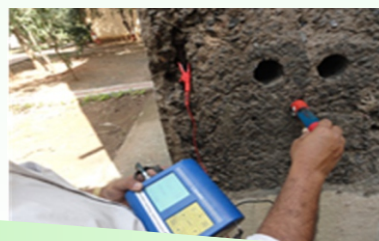
Half-cell Potential Measurement of Corrosion Damaged Structure