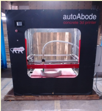
Lab scale 3D concrete printer

To enhance the experimental capability of the centre, several testing equipment related to study of cement and concrete characteristics and its behavior have been added. These equipment are procured under plan grant for different R&D and Sponsored Projects. The laboratory comprises of advance equipment for testing mechanical and durability parameter of various research projects.