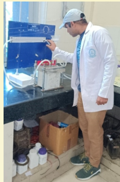
Initial surface absorption test (ISAT) apparatus to evaluate the rate of water absorption by concrete samples