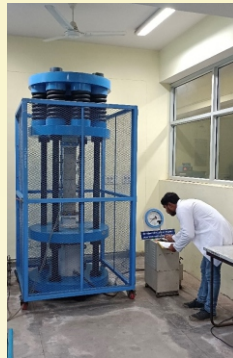
Creep testing apparatus to evaluate creep coefficient