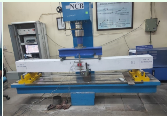
Flexural test setup for Geopolymer Reinforced Concrete Beams (In Flexure)