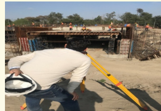
Underpasses / Tunnel works in Pragati Maidan- PWD, New Delhi