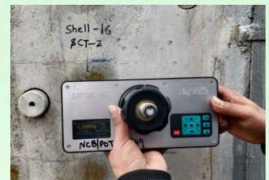
Pull-Off Test Being done to check bonding of PMM with substrate concrete