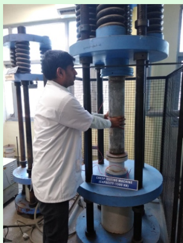
Test for Determination of Creep Coefficient (In Compression)