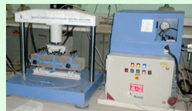
Flexure toughness test on Steel Fibre Reinforced Concrete