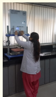
Net Transverse strength of Cement concrete tile using Flexure Testing Machine of 10kN