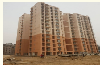
Quarters at Jasola- DDA, Delhi