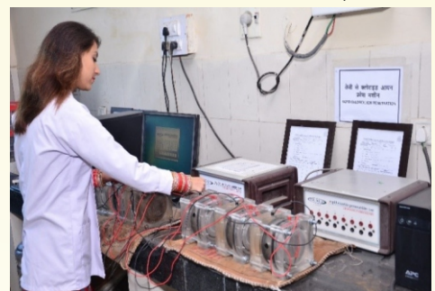
Rapid Chloride Penetrability Test for concrete Samples to study the chloride ions penetrability.

Nondestructive Testing and Distress Investigation Lab with state of the art equipment such as digital Rebound Hammer, UPV tester, Corrosion Analyzer, Endoscopy, Pile Integrity Tester, Ground Penetrating Radar, Impact Echo Tester etc.