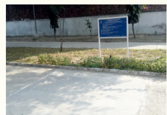
Trial Stretch made using Geopolymer Concrete