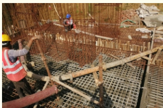
Central Public Works Dept. (Srinivaspuri, Delhi)