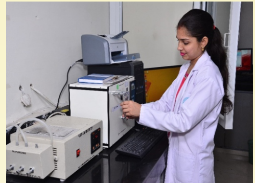
BET Apparatus for determining fineness of ultra-fine powder materials such as silica fume, metakoline, ultrafine fly ash, ultrafine slag etc.