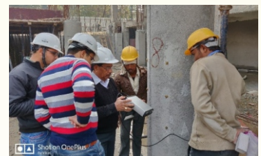
PUNDIT Lab Plus (UPV Tester) for Quality Assessment