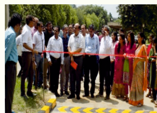
Inauguration of Trial Stretch made using Geopolymer paver blocks