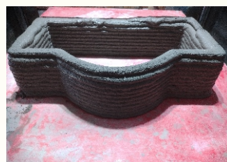
3D Printed Concrete object manufactured using indigenous developed 3D customized printer