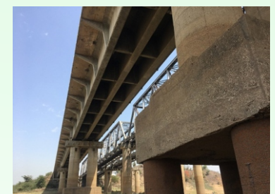
Condition Assessment of RCC Bridges