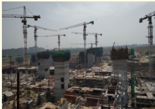
India International Convention & Expo Centre, Dwarka-New Delhi