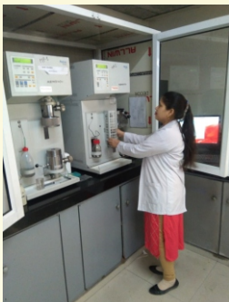
Mercury Intrusion Porosimeter test is used to study the pore size distribution and porosity of aggregate, concrete and mortar.