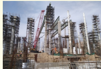
Conventional Centre in Pragati Maidan – ITPO, New Delhi