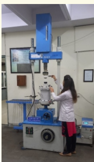
Confined Compressive strength of Concrete and Rock Specimens