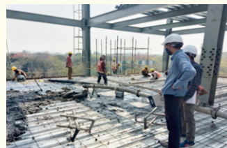
Non-Residential Buildings using Pre-Engineered Construction Technology at KG Marg and Africa Avenue, Delhi