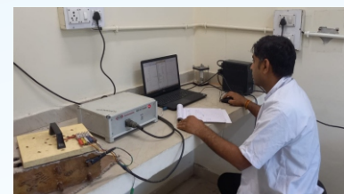
Corrosion rate measurement