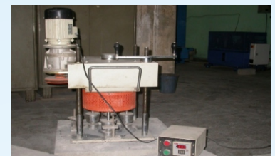
Abrasion Resistance test for Concrete