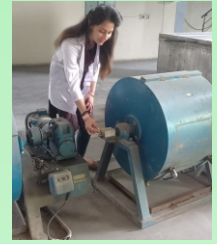
Abrasion Value Test for Aggregate