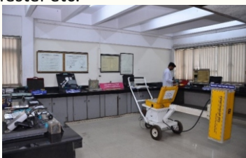
State of art Non-Destructive Testing Laboratory at NCB Ballabgarh

Nondestructive Testing and Distress Investigation Lab with state of the art equipment such as digital Rebound Hammer, UPV tester, Corrosion Analyzer, Endoscopy, Pile Integrity Tester, Ground Penetrating Radar, Impact Echo Tester etc.