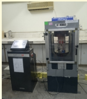
Test for Stress Strain Characteristics in progress for High Strength Concrete