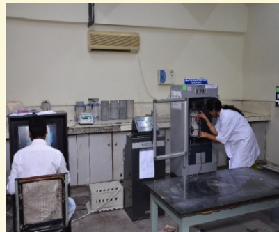
Modulus of Elasticity and Poisson's ratio determination through high precision servo controlled Compression Testing Machine-3000kN