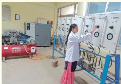
Water Permeability Test on concrete samples.