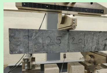
Testing of notched beam in progress for the study of fracture behaviour of High Strength Concrete