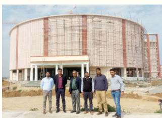
Construction of VC & Administration Building for Lala Lajpat Rai University for Veterinary and Animal Science at Hisar, Haryana