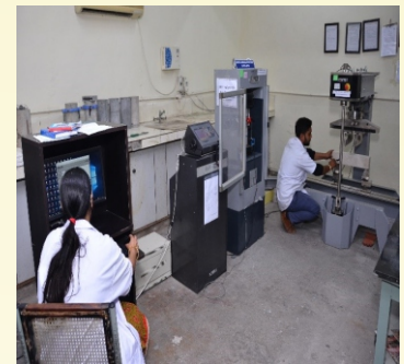
Strain Controlled Flexural Testing Machine-300kN for determination of flexural toughness of fiber reinforced concrete and crack mouth opening gauge for measurement and control of crack width in concrete samples