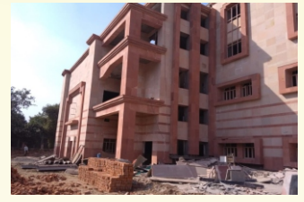
Museum at Noida- CPWD