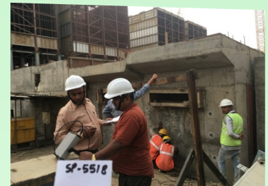
UPV test of Concrete Structure for Quality Assessment