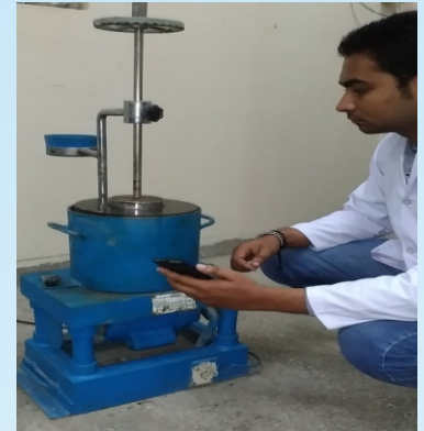
Workability Measurement of Roller Compacted Concrete