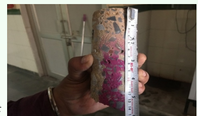
Carbonation depth being measured on freshly extracted core at site