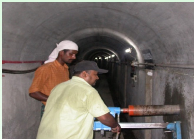
Concrete Core extraction of 150 mm diameter & 1 metre length from gallery of Gravity Dam