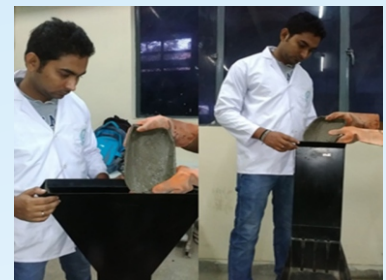
V-Funnel & L-Box Test for SCC