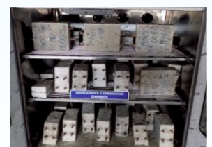
Accelerated Carbonation Induced Corrosion Study