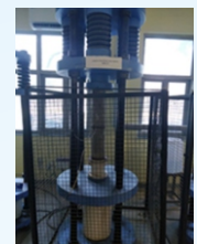
Creep testing in loaded condition