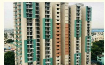
Central Revenue Quarters– CPWD, Chennai