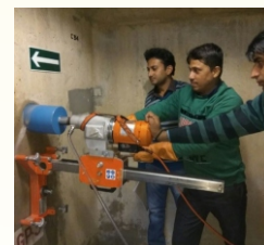
Extraction of Concrete Core of 150 mm diameter from Gallery Portion of Dam structure