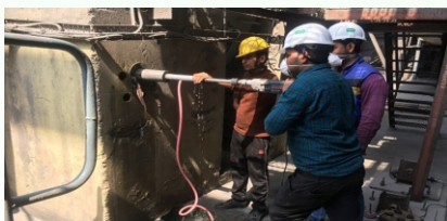
Core extraction from RCC foundation